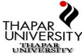
THAPAR UNIVERSITY THAPAR UNIVERSITY